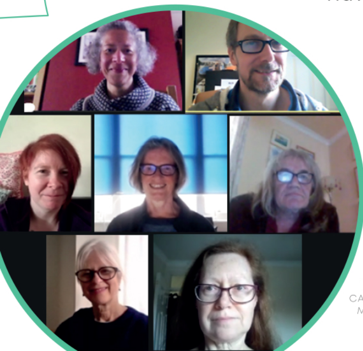
LEFT IMAGE: CARERS VOICE MEET ONLINE