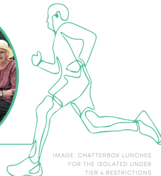
IMAGE: CHATTERBOX LUNCHES FOR THE ISOLATED UNDER TIER 4 RESTRICTIONS