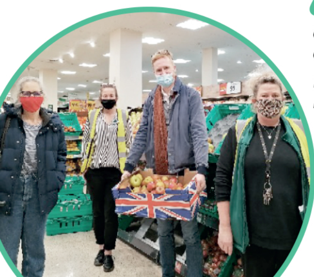
IMAGE: CLLR KNIGHT & MP RUSSELL MOYLE COLLECTING FOOD FOR COMMUNITY MARKET.

VOLUNTEER COORDINATOR BRISTOL ESTATE FOOD HUB